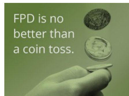
FPD predicts account loss only about 50% of the time.

The key to this transformation is adopting real-time customer identity intelligence focused on profitability instead of FPD.